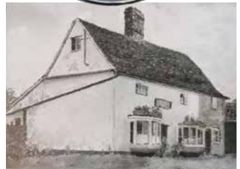
Found a very old photo of the pub, looks many moons ago, you can just see Simon in the upper window when he was about 30!