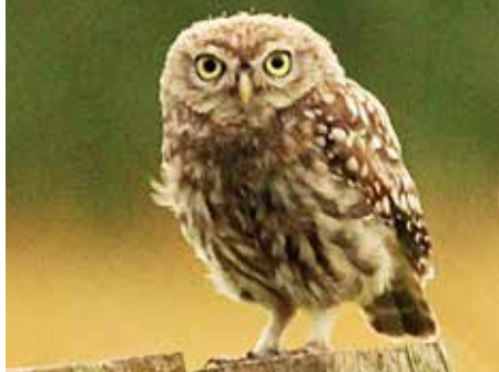
Snap around the village! . . . Little Owl

year and the squirrels are back stealing nuts from the trees.