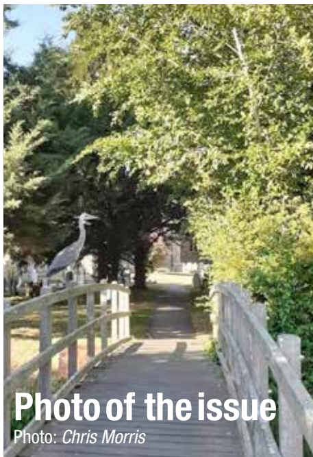
Photo of the issue

On Saturday 4th October from 2.30-4.30 pm we will be holding our Harvest Treasure Hunt for all the family. Afternoon teas will also be available. The following day, on Sunday 5th October at 11am our Harvest Festival Service will take place followed by a Harvest lunch.